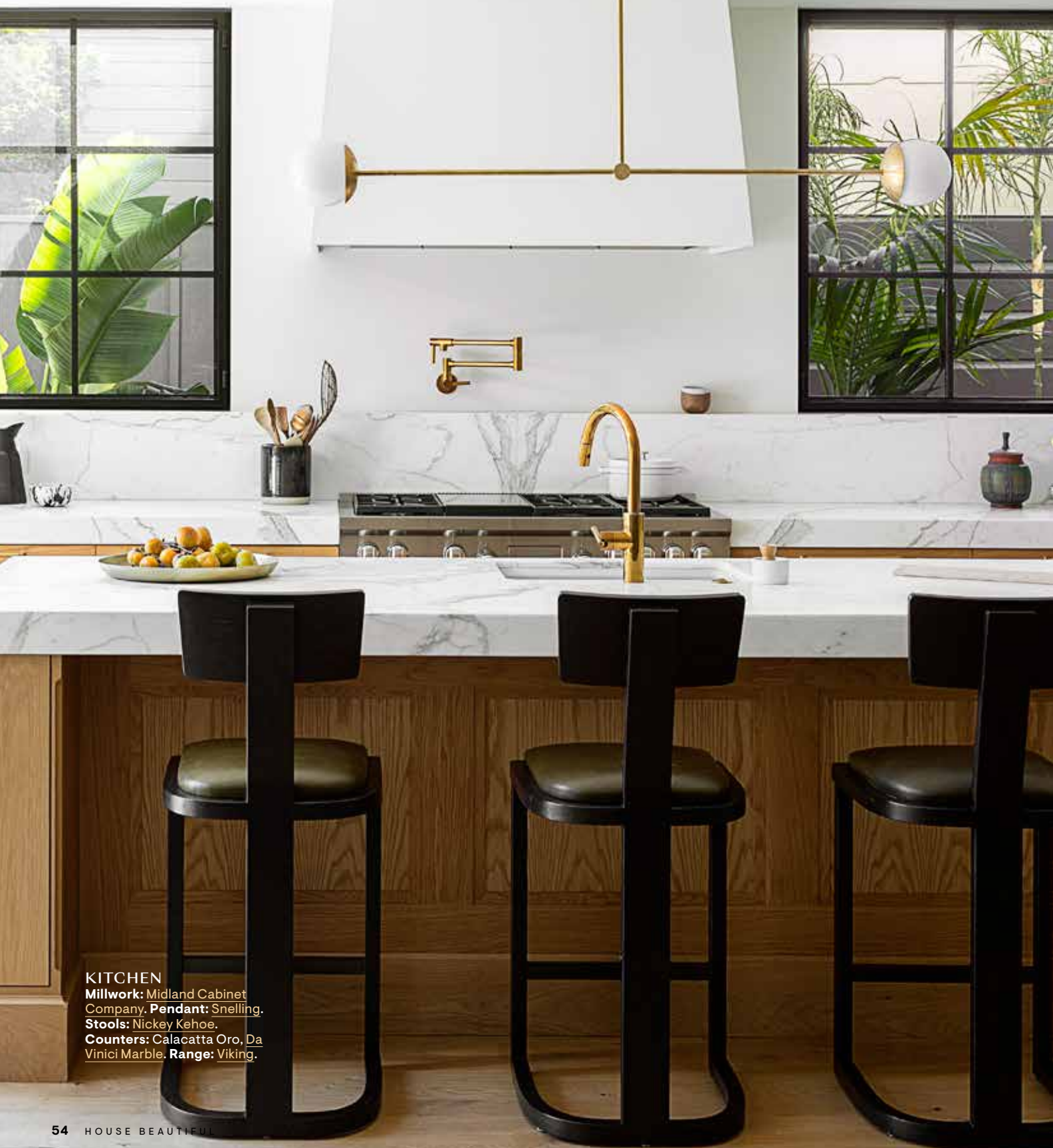
KITCHEN Millwork: Midland Cabinet Company. Pendant: Snelling. Stools: Nickey Kehoe. Counters: Calacatta Oro, Da Vinici Marble. Range: Viking.