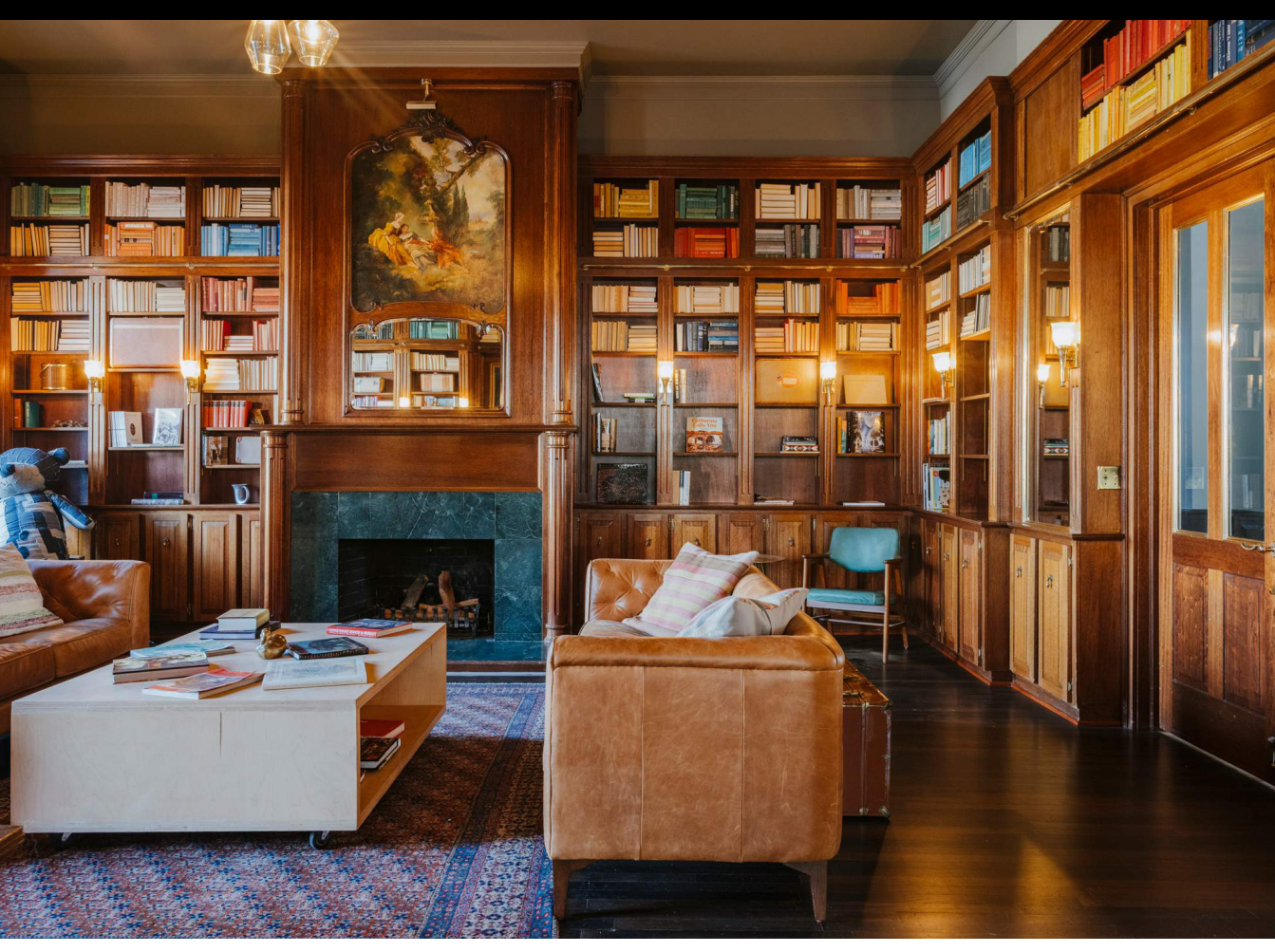
Thatcher Hotel library