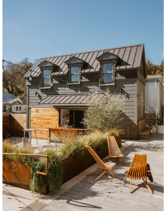
Mixing it at the bar