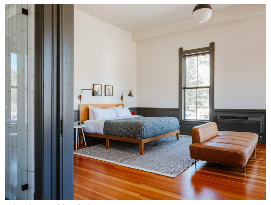
Medium Plenty revived the outdated guest rooms