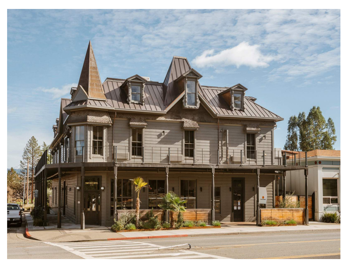
The Thatcher Hotel